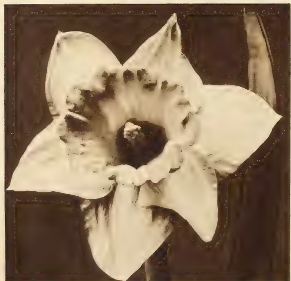
BI-COLOR TRUMPET SINGLE DAFFODILS